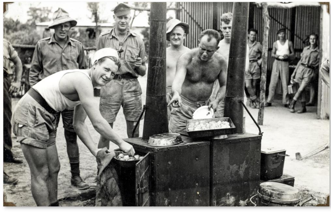
2/2nd Pioneer Battalion cooking Xmas lunch, 25 December 1942 2/2nd Pioneer Battalion cooking Xmas lunch in camp, southwest of Geraldton, Western Australia, 25 December 1942.